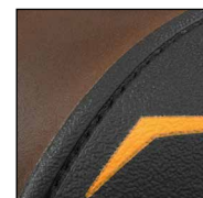
RTC with countersunk seams