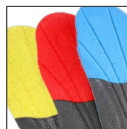
HAIX® Vario Wide Fit System