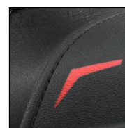
RTC with countersunk seams